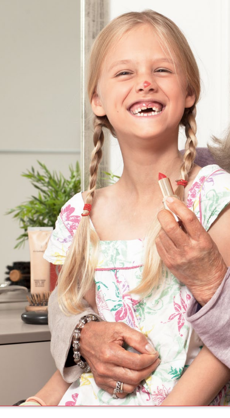
Restore your teeth, win back your life.