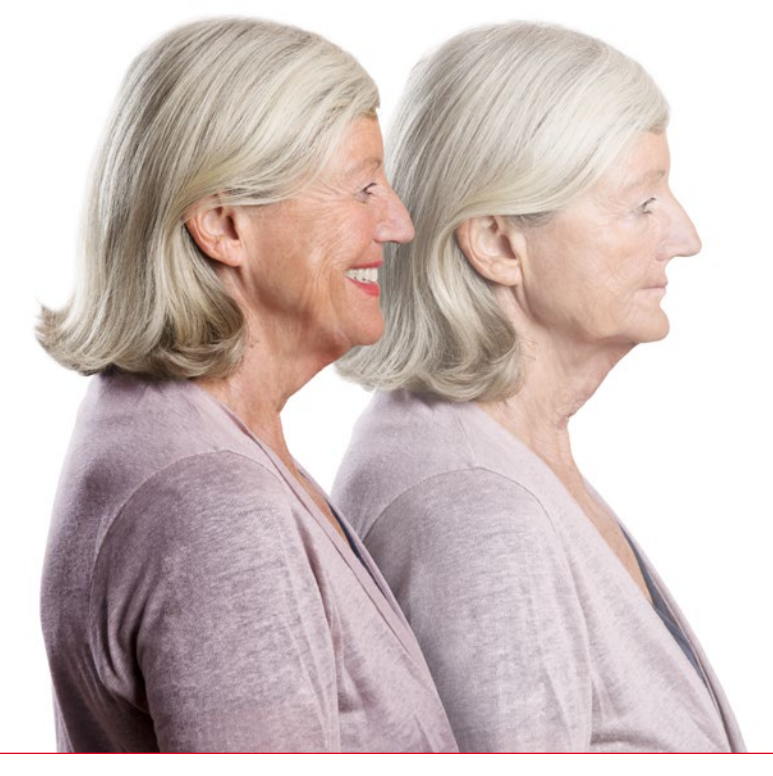
This picture clearly shows the consequences of tooth and bone loss.